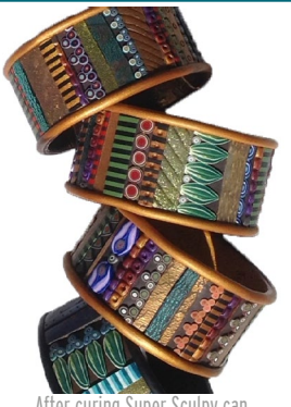
be further worked into