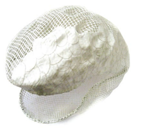
A simple dinosaur mask made using aluminium armature wire with heavy Varaform and Membrane scales.